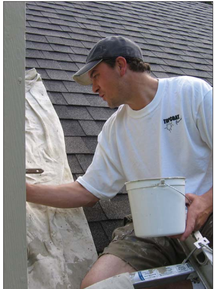
The author supervises painters in a Department of Labor-funded "Step up to Painting" program to train and encourage women to enter the paint trades.

The condition of our workforce is not going to improve until each of us takes some individual responsibility for taking painters into the field and teaching them the craft of the professional painter. I would encourage any contractor to become more involved in looking for opportunities that would advance not only our individual operation, but also the trade as a whole. I can tell you from personal experience that there is just about no better feeling than hiring an experienced painter who was properly trained from day one. One of our best painters came from a company in Boston called Catchlight Painting, where he had worked for four years. I was so happy to see his skill set and work habits, and happy to integrate him into our crew, but also thankful to Catchlight Painting for having such a solid apprenticeship program in place.